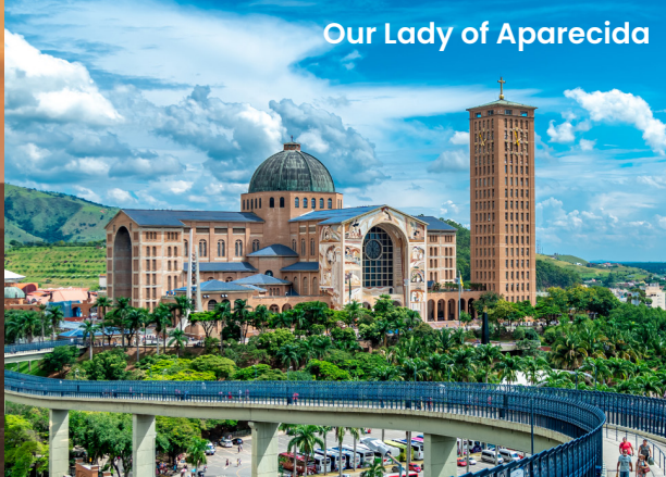
Our Lady of Aparecida